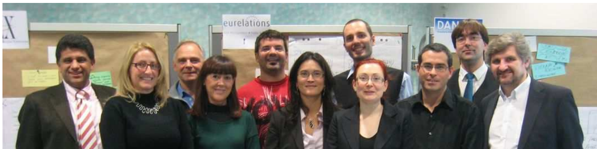
Personal members of the smE-MPOWER Community

Eleven representatives from nine organisations in eight countries followed the call investing in the long-term vision of building innovation support competence and a strong strategic network of visionary innovation agencies together.